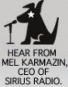
HEAR FROM MEL KARMAZIN, CEO OF SIRIUS RADIO.